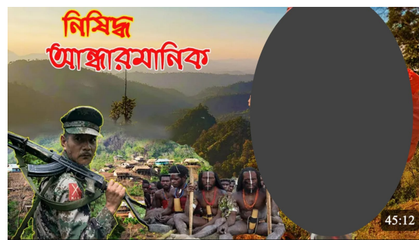
(b) Misrepresenting the Indigenous communities by including unknown community members in the thumbnail (Creator's Face Hidden) [152]. Thumbnail text translates to ‘Forbidden Andharmanik’ whereas “Andharmanik” has limited access.