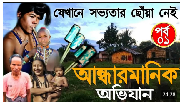
(a) Incorrect text and visual misrepresentation in the YouTube Thumbnail [107]. The translated thumbnail text (top) “Where there is no touch of civilization” is incorrect and the inclusion of unknown community members is misleading.