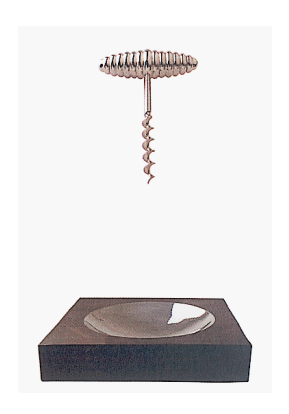
Figure 1. The Objective View proposal from the first, in-house Alternatives workbook.

capture an image of the user in his or her surroundings, counter-acting the normal self-centred view whatever troubling situation might be bothering them. Constructed from a picture of a corkscrew arranged over one of a bowl, the notion was that the swirling tail might indicate flight, and the indentation of the bowl could suggest a data receiver. Though crude, images such as this one seemed to work well when accompanied by relatively extensive descriptions to convey ideas that were, at the time, relatively unusual.