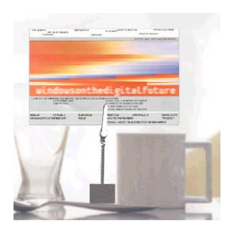
Figure 2. Detail of the Placeholder proposal from the second Alternatives workbook.

accompany a proposal for Placeholders, electronic screens that could present information in the home independently from the computers that might feed them. Though centred on an image of a postcard similar to holder. everyday artefacts used in the first workbook, it is substantially augmented with a background image of a table and crockery, as well as constructed imagery of possible screen contents.