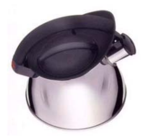
Figure 3: A utilitarian kettle (the OXO Good Grips tea kettle). The shield is designed to prevent steam from burning the hand.

Thus, even when motivated primarily by considerations of utility, the designer may sometimes be concerned about potential undesirable consequences, and therefore about emotions. In such cases, we say the designer's stance vis à vis emotions is one of emotion-prevention. Consider, for example, the kettle shown in Figure 3. Such a kettle could function perfectly well (and would be easier to construct) if it were made of a single material such as stainless steel. But this would allow the handle to get hot. But notice that the choice of a non-conducting material for the handle can be motivated by either the utility-focused goal of preventing users from burning their hands, or by the emotion-focused goal of preventing the resultant anger. In either case, the end result would be the same.