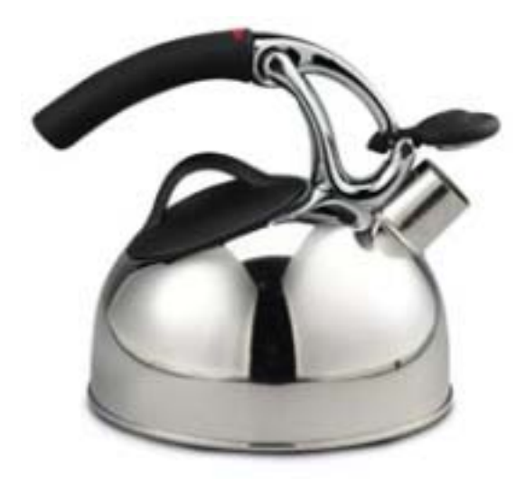
Figure 4. OXO Good grips uplift kettle. This kettle, from the same manufacturer as the one shown in Figure 3, overcomes its problem. The handle is heat resistant, and the lid over the spout opens automatically simply by tilting the teapot, so no finger can get burned.

The advertising copy for this kettle (from the OXO company website) describes the kettle in very utilitarian terms: