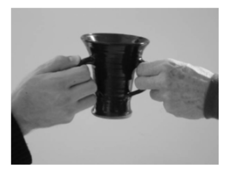
Figure 2. The Tyg: Three handled drinking cup making it easy to pass from one person to another. The third handle is invisible, being directly behind the tyg in this photograph. (Photo by D. A. Norman).

The tyg is an example of a product whose primary design consideration is utilitarian. In other cases, it is can be more difficult to separate function from appearance. One would think that kettles for boiling water should be relatively simple and highly utilitarian. One might think that the primary consideration in the design of a kettle design would that of utility: the thing should be an effective device for boiling water and pouring it. However, the basic kettle has several unintended consequences that induce negative emotions in users – emotions by accident. In particular, users can burn themselves for a variety of reasons: the handles can become uncomfortably hot, the steam from the boiling water might scald the user, and the kettle might drip during pouring. Through experiences with unsatisfactory kettles, designers have sought to eliminate these unintended negative consequences and their attendant emotions.